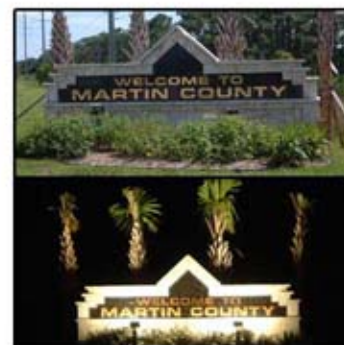
SIGN FLOOD LIGHTING