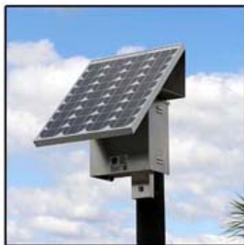
SMALL SYSTEMS From 5 to 50 Watts