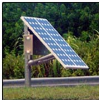
LARGE SYSTEMS From 160 to 255 Watts