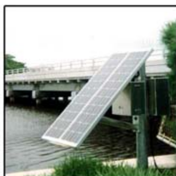
MONITOR & DATA