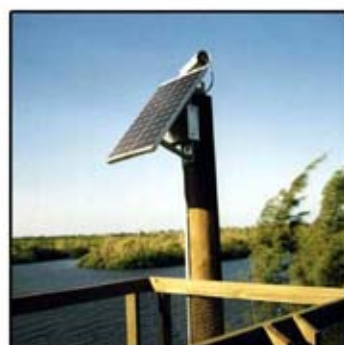
CAMERA & VIDEO