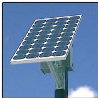
MEDIUM SYSTEMS From 80 to 110 Watts