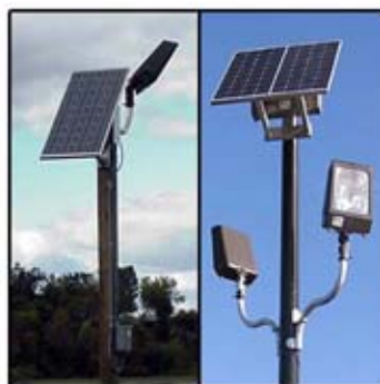
SINGLE & DOUBLE POWER FLOOD LIGHTING