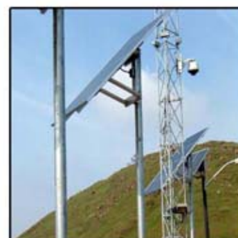
MILITARY & DHS