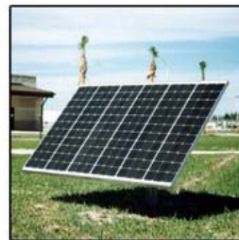
EX-LARGE SYSTEMS From 300 to 340 Watts